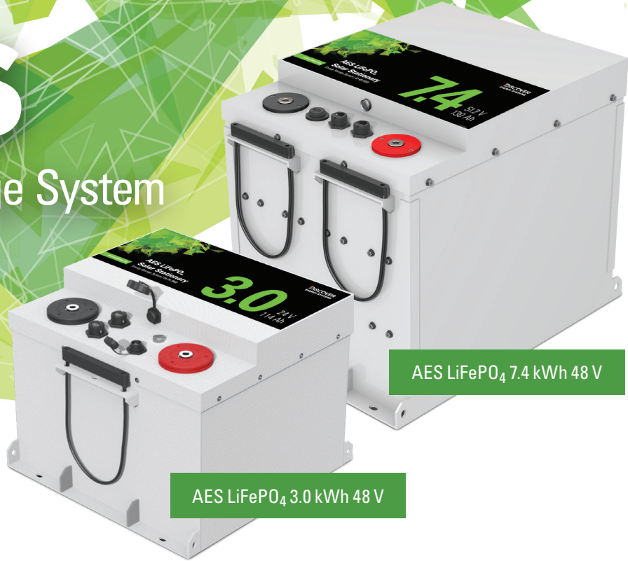
AES LiFePO 4 7.4 kWh 48 V